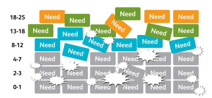
See Adoption UK's website www.adoptionuk.org for 'The Wall' demonstration

This metaphoric wall is on the inside. Externally he looks like all the other kids on the block. How would, or could, anyone know the inside is so damaged? Only by viewing his behaviour through the trauma filter and piecing together the jigsaw of his past. (FYI: The jigsaw always has missing pieces, which complicates things still further). As I said, it's not easy!